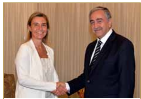
24 July 2015 High Representative of the European Union for Foreign Affairs and Security Policy, Federica Mogherini