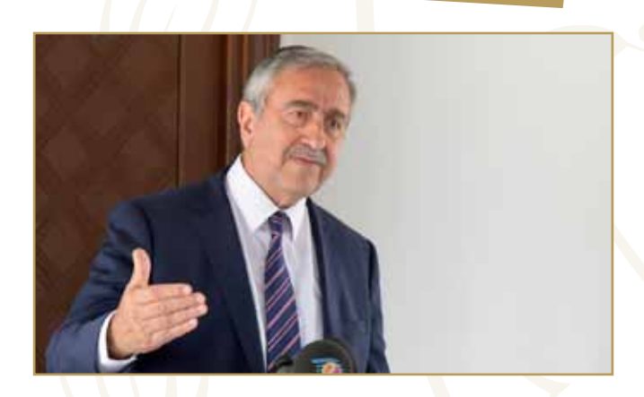
Duration: 4 hours

At the meeting which focused on issues of substance for the first time, leaders worked on a document identifying the position of both parties on all chapters.