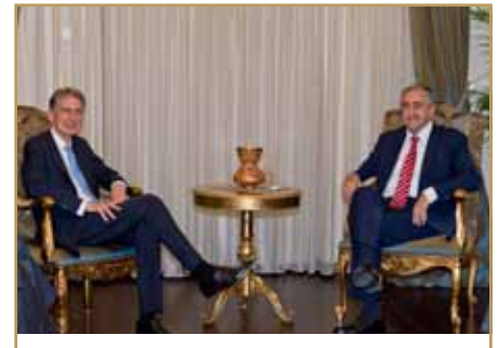
17 July 2015 UK Secretary of State for Foreign and Commonwealth Affairs Philip Hammond