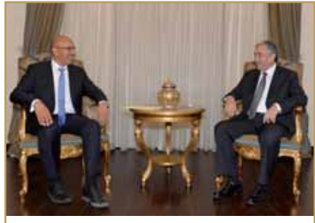
3 July 2015 France's Minister of State for European Affairs Harlem Désir