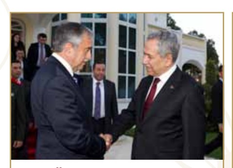
30 April 2015 Turkey's Deputy Prime Minister Bülent Arınç