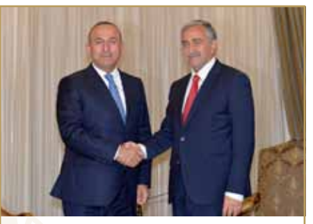
26 May 2015 Turkey's Foreign Minister Mevlüt Çavuşoğlu