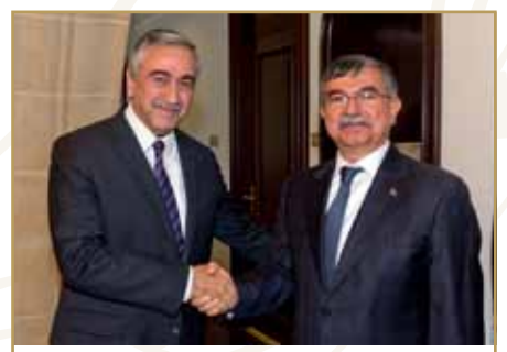
19 July 2015 Speaker of the Grand National Assembly of Turkey, İsmet Yılmaz